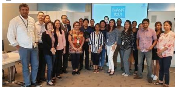
ISO 2022 Master Class February, 2020 Mauritius